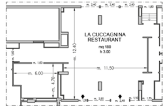
Piano Terra / Ground Floor